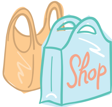
All Plastic Bags and Plastic Wrap