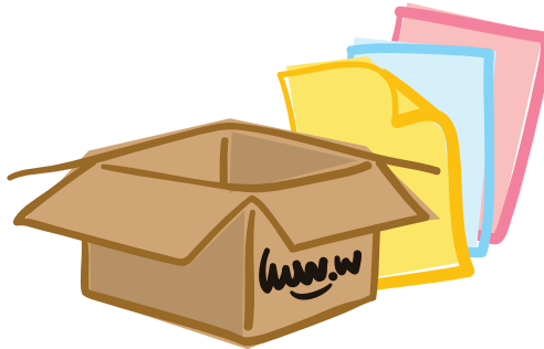
Paper and Cardboard